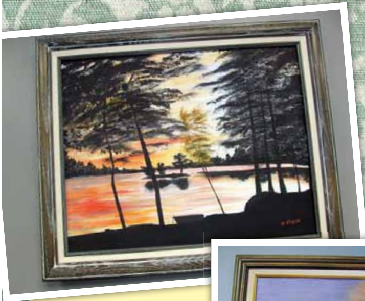
2nd Place – Stan Chase