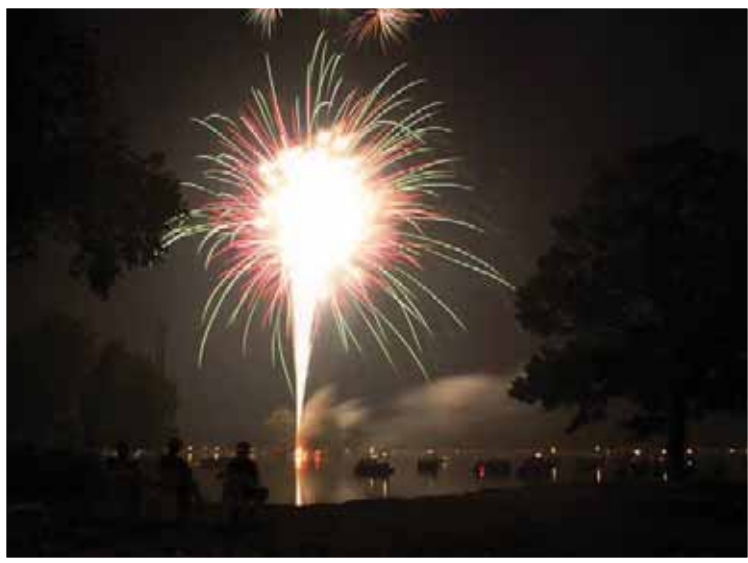
1st Place – Sal Poppema