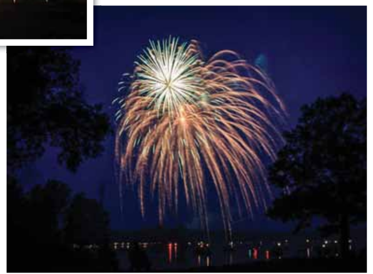
2nd Place – Sal Poppema