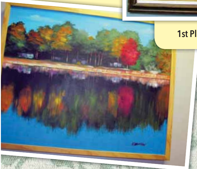
1st Place – DAN DUNCAN