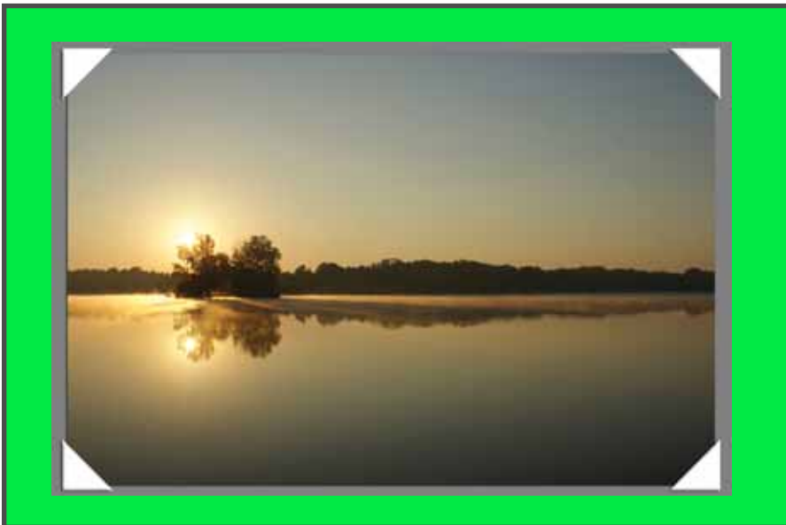
Third Place Phil Payne