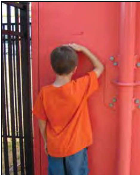
"How tall do I have to be?" This photo was submitted by one of our members who observed this young man checking to see how much he'd grown over the summer, so he could try the Ropes Course!

Sandy Pines Has Talent! Pictured below are the artistic young people who participated in the Sandy Pines Talent Show recently. Over 200 guests came to see them perform. Thanks for sharing your various talents with us. Practice up for next year when we have our 40th Anniversary Talent Show!