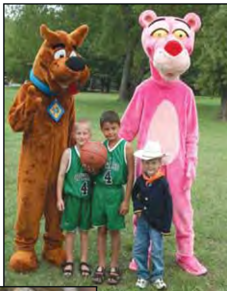
Scooby Doo and the Pink Panther recently visited Sandy Pines and enjoyed a wagon ride around the Park. They stuck around for a few photos with some of our kids who were dressed up for Halloween!