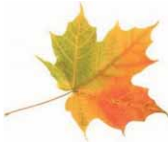
Third Place - Tie