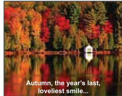
Autumn, the year's last, loveliest smile...