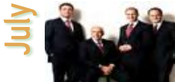
The Mark Trammel Quartet