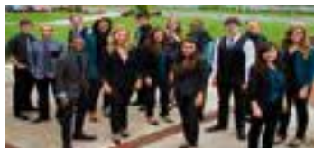
Voices of Lee

"Come, let us sing for joy to the Lord; let us shout aloud to the Rock of our salvation." Psalm 95:1