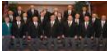
Heritage Singing Men

As history recorded the 200th birthday of the USA in 1976, a group of Christian men begin to sing songs of their American heritage. As time went on, they included in their programs songs of their Christian heritage as well. They have continued to do this, singing in worship services, programs, hymn sings and rest homes.