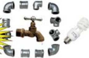
Plumbing & Electrical Supplies

Fasteners, paint, cleaning products, insect control, pet supplies, toys & more!