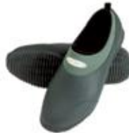
Muck Boots & Carhartt Clothing