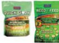
Lawn & garden supplies