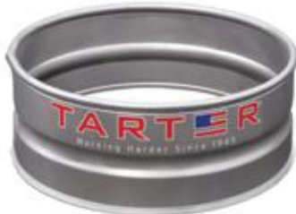
Fire pit rings