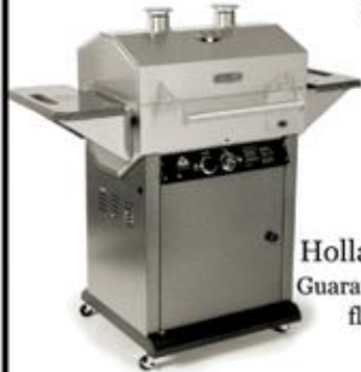
Holland Grills Guaranteed not to flare up!

Come see our new store and expanded selection! We have something for everyone!