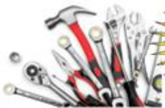
Hand & Power tools