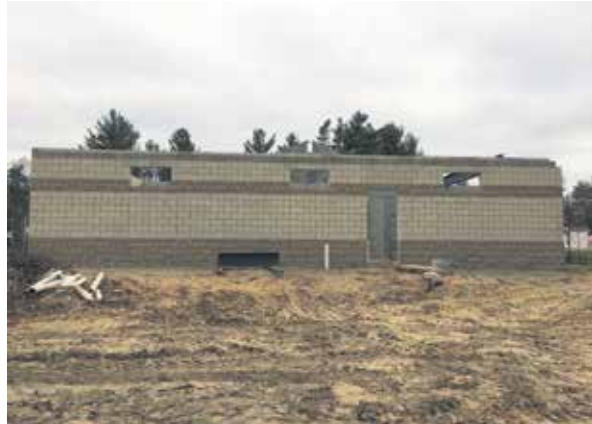
Building #6 from South 11/22/17