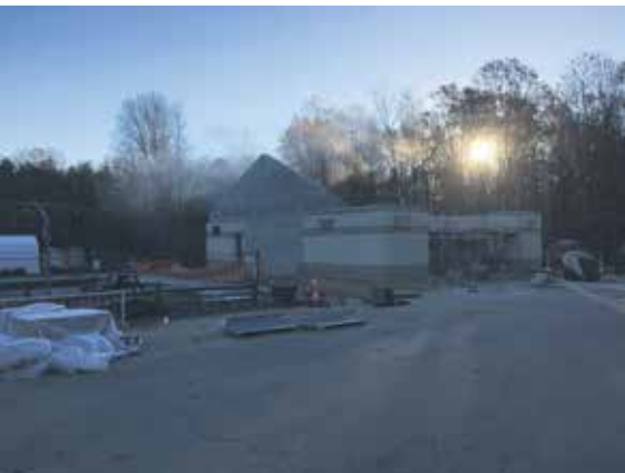
Building #6 from NW 11/29/17