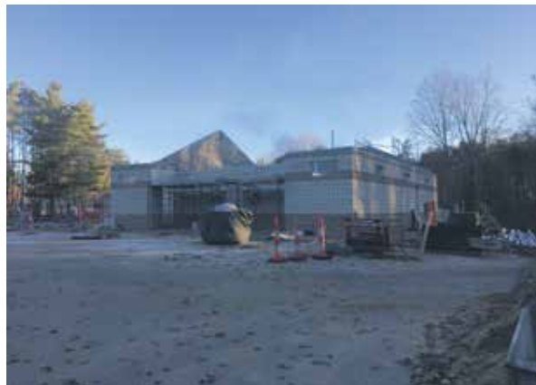
Building #6 from SW 11/29/17