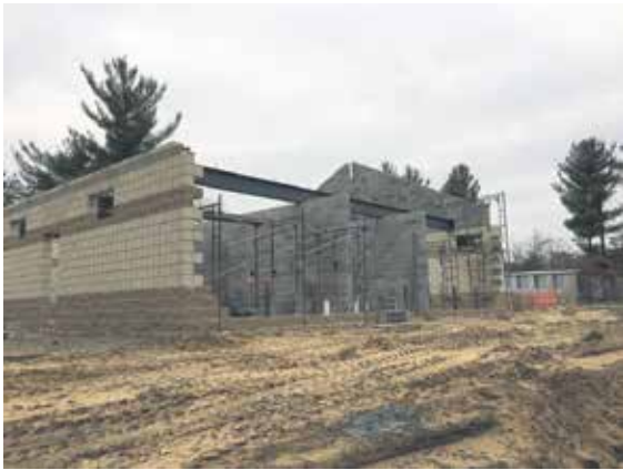
Building #6 from SE 11/22/17