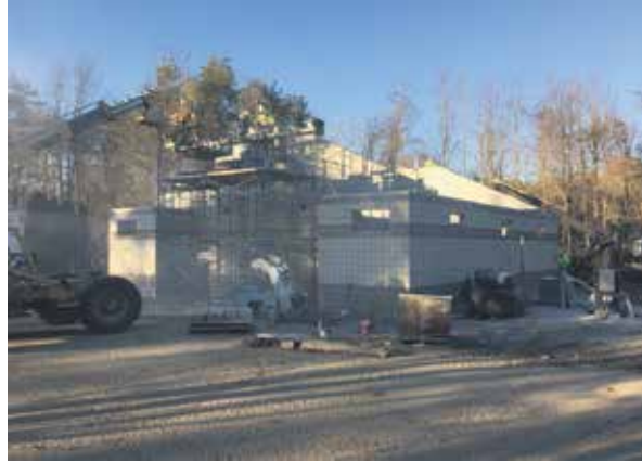
Building #5 from NE 11/29/17