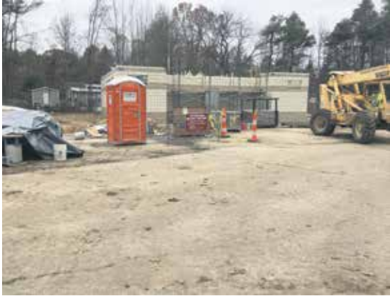
Building #5 from SE 11/22/17