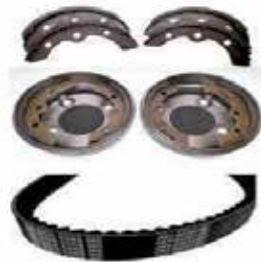
Wheels & Tires

Fully stocked parts department open year round!