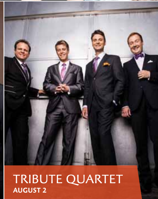
TRIBUTE QUARTET AUGUST 2