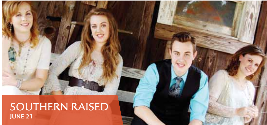
SOUTHERN RAISED JUNE 21