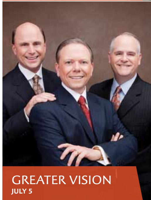
GREATER VISION JULY 5