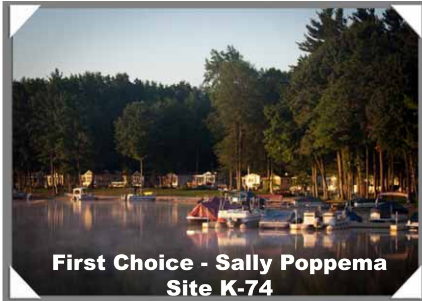
First Choice - Sally Poppema Site K-74