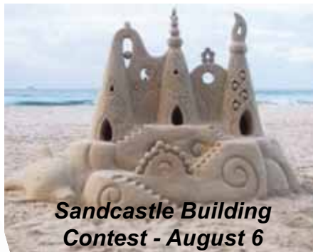
Sandcastle Building Contest - August 6