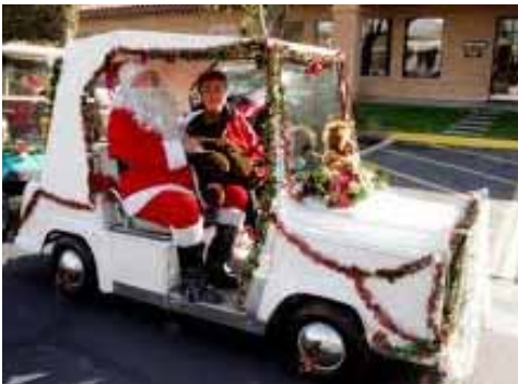
Christmas Lights Site-seeing Tour - August 13