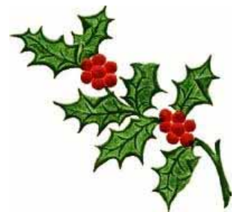
Third Place Valorie LeFevre