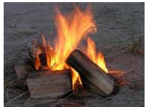
Campfire - Aug. 19 Phase 4 Beach