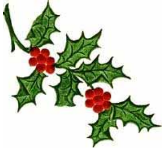
Second Place Pam Kriekard