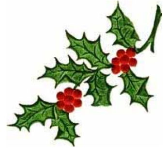
First Place Beth Hawley