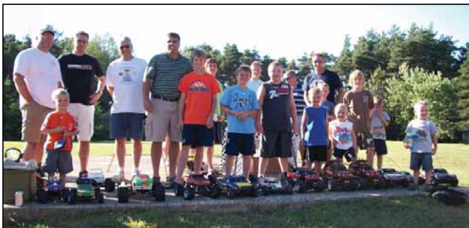
Remote Control Car Racers pictured with their Remote Controlled Cars