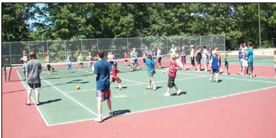
Another Saturday afternoon game of Dodgeball. Everyone is welcome. Come and join us!