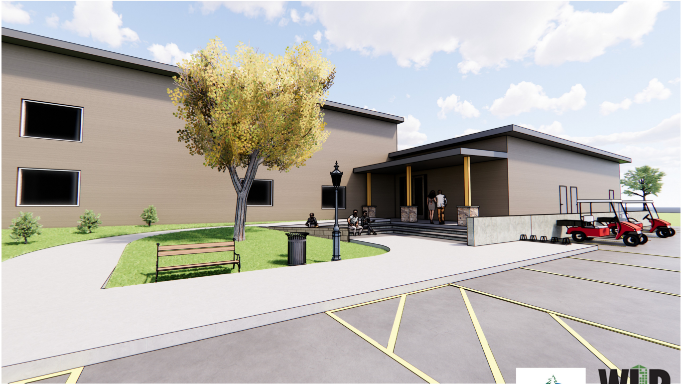
SANDY PINES REC. CENTER #2