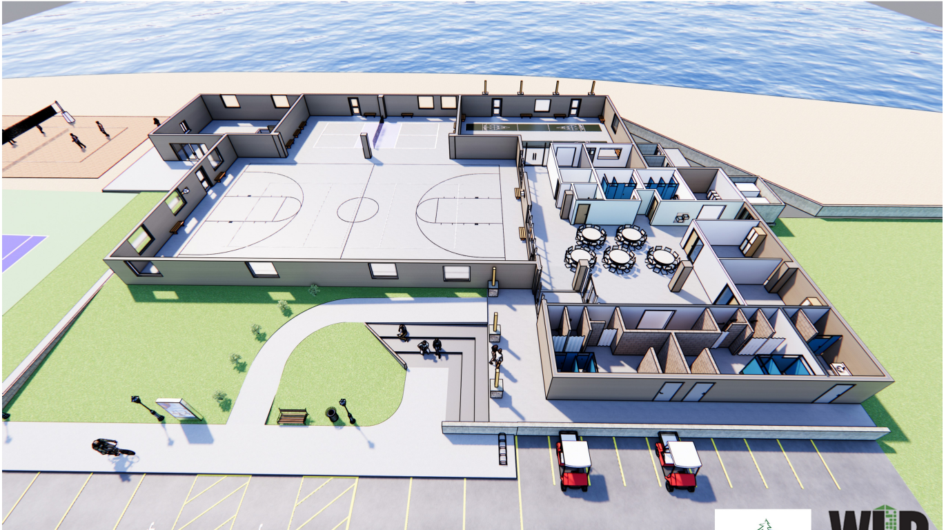
SANDY PINES REC. CENTER #2