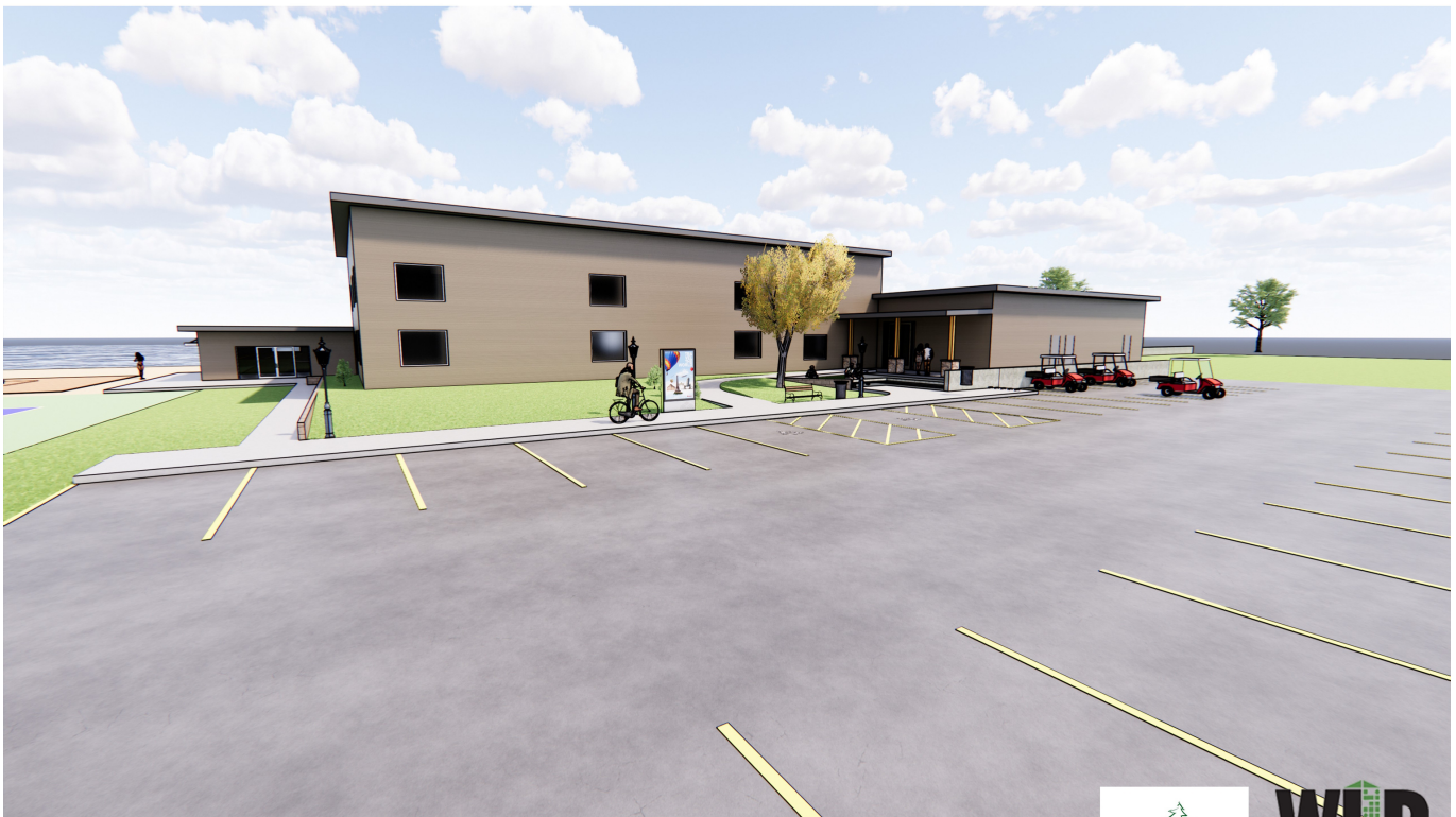
SANDY PINES REC. CENTER #2