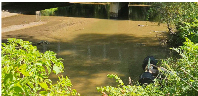
Rabbit River levels are low

Sandy Pines is not the only entity experiencing low water levels. Rabbit River, which is just north of Sandy Pines (138th and 26th St.) is very shallow with the river showing sand bars above the water surface.