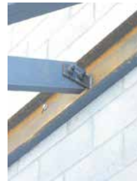
Building #6 bolted connections 1/17/18