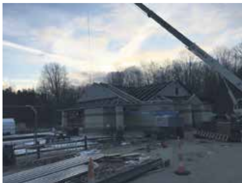
Building #6 from NW 1/24/18