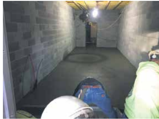
Building #5 first pour 1/24/18