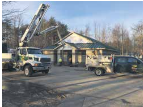
Building #5 roof on 1/24/18