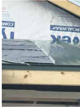
Building #5 standing seam clips 1/17/18