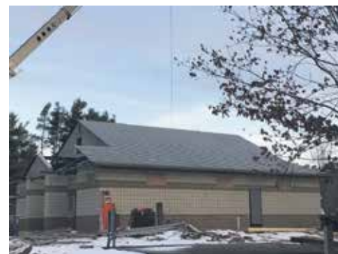
Building #6 from SW 1/24/18